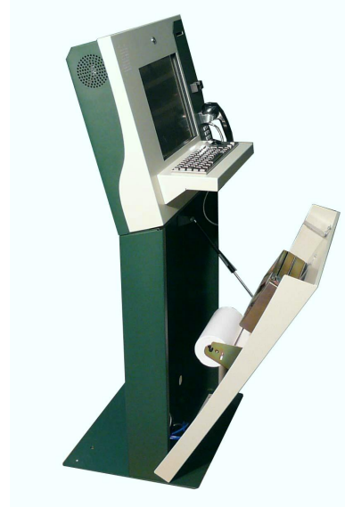
Easy Maintenance of Bottom Components

The kiosk is designed for durability and security in a public environment. The main body of the kiosk is manufactured out of powder-coated 14 gauge steel, with key-lock doors.