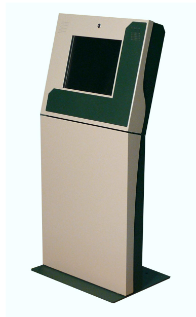
Configure with or without a wide range of peripherals