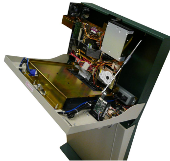
Computer components mounted on a hinged bracket for easy access