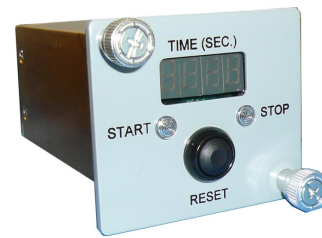
6 Removeable Modules