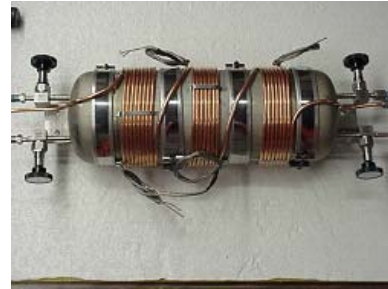
Example of heated and cooled mol sieve bed

They are also known for their ability to hold or trap transported gases in inert gas streams at certain clearly defined temperatures.